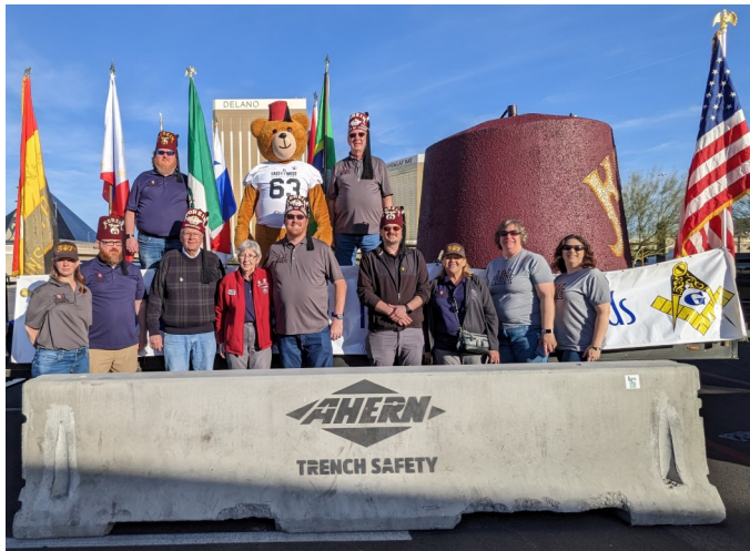
Big group from Cheyenne